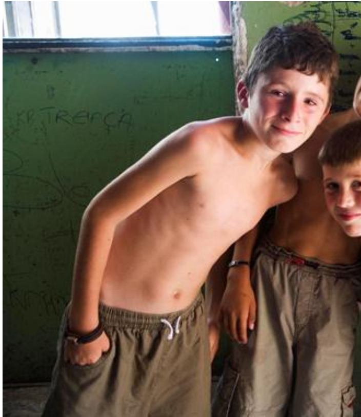
Kosovo Albanian children displaced in Mitrovica/South